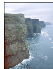
Cliffs of Moher, Cty. Clare, Galway