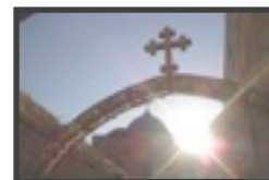
The real "Way of the Cross" in Jerusalem!