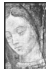
Close-up of Mary's face!

→ 25 - APRIL - 04: MAY BEATIFICATION OF JP II IN ITALY - A Powerful Catholic Pilgrimage with visits to Naples, Florence & ROMA. See the Shrine of St. Philomena, Attend the Beatification of JP II and many other exciting events! FROM CHICAGO and HOUSTON, TEXAS