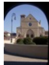
Our Lady of the Angel's Monastery

→ 15 - 21: OUR LADY OF GUADALUPE SUMMER PILGRIMAGE (MEXICO) - VISITING MEXICO CITY, LA VILLITA, PUEBLA, CHOLULA, TLAXCALA, TEOTIHUACAN, & MUCH MORE! FROM MINNEAPOLIS, CHICAGO & HOUSTON