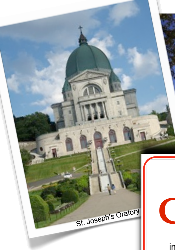
St. Joseph's Oratory