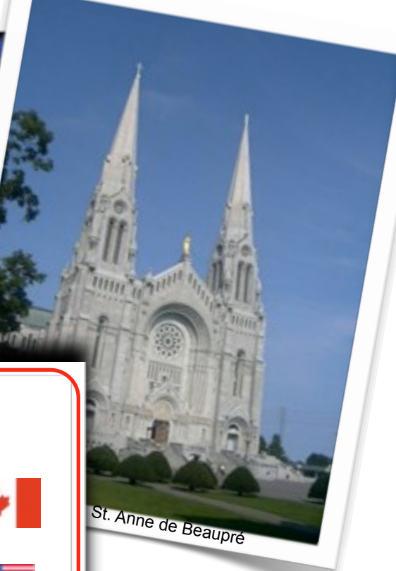
St. Anne de Beaupré