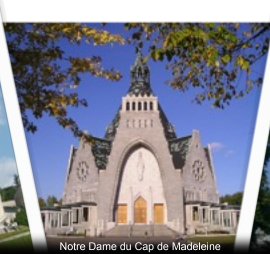
Notre Dame du Cap de Madeleine