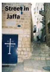
Street in Jaffa

Enjoy a relaxing day in the Tel Aviv area. First, travel to St. Peter’s Church in the historical port town of Jaffa . This Church commemorates the place where St. Peter gave his farewell speech before departing for Rome. The last place where St. Peter lived in the Holy Land is just around the corner. Explore this quaint town and then transfer to the hotel in the Bat Yam for leisure afternoon. Later join our group for our farewell dinner. (B, D)