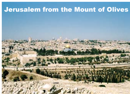
Jerusalem from the Mount of Olives

Start the day early, praying the Stations of the Cross as we walk the true Way of the Cross (Via Dolorosa) , ending up at the Church of the Holy Sepulcher , where Jesus was crucified (Calvary) and buried, and then rose again. Continue with an unforgettable High Mass at the Tomb (pending confirmation). Then visit the Wailing (or Western) Wall , and the Temple Area with views of the Al-Aksa Mosque and Dome of the Rock. See the Pool of Bethesda scene of one of Jesus’ healings (the paralytic and the wind-ruffled pool water). Visit the Convent of Zion Sisters and St. Ann’s Church (birthplace of the virgin Mary) . See the site known as David’s tomb and then visit the Caenaculum , the place where the Last Supper occurred as well as the Descent of the Holy