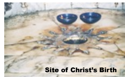
Site of Christ's Birth

Travel to Bethlehem and see the Church of the Nativity and below it, the cave-stable of Jesus' birth . Holy Mass is celebrated here. Afterwards we divide into small groups to share lunch at the homes of local Christian families . After lunch we drive to the town of Beit Sahour where we find the Shepherd's Fields , inhabited by Christians for hundreds of years. Return to Jerusalem where this evening we make a traditional solemn entry (pending confirmation) to the Church of the Holy Sepulcher . (B, L, D)