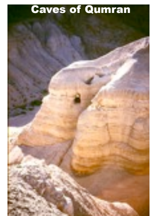
Caves of Qumran