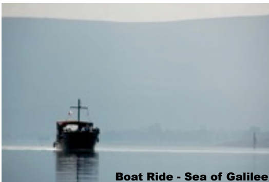
Boat Ride - Sea of Galilee

Travel to the shores of the Sea of Galilee (also known as the Lake of Genesareth or Sea of Tiberias) and take the memorable boat ride across the same lake Jesus walked. Then travel to Capernaum ; there we see the ancient synagogue of Capernaum , and St. Peter's house which was later converted into a church where Holy Mass is celebrated. By the shore we visit Tabgha with the Church of Peter's Primacy and the famous ancient mosaic of the Loaves and Fishes . A memorable fish lunch follows (included - St. Peter's Fish). Continue to the Mount of Beatitudes where the Sermon on the Mount is remembered. * Afterwards, if conditions are favorable and time allows, we can travel to beautiful Caesarea Philippi . (B, L, D)