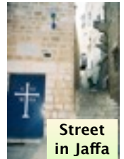
Street in Jaffa

After a short layover in Europe, we arrive at Ben Gurion Airport in Tel Aviv. Clear Israeli immigrations and customs formalities and follow our escort's umbrella to the "Groups Assembly Exit". A thanksgiving Mass is planned (for a safe voyage) at St. Peter's Church in the historical port town of Jaffa . This church commemorates the place where St. Peter gave his farewell speech before departing for Rome. The last place where St. Peter lived in the Holy Land is just around the corner. Transfer to the hotel in the Tel Aviv area for a welcome dinner and overnight. Relax tonight as you adjust to Israel's time zone. (M, D)