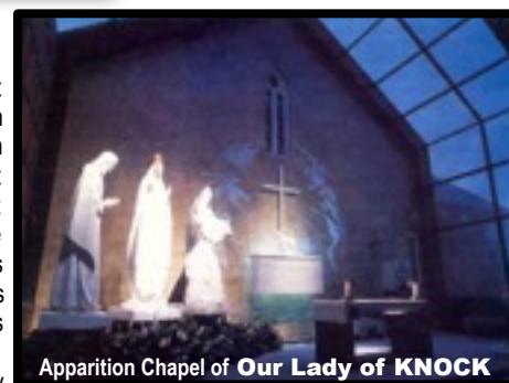
Apparition Chapel of Our Lady of KNOCK

Start the day with Sunday Mass at the Knock Shrine. After Mass, travel west through County Mayo and arrive at Ballintubber Abbey where St. Patrick's Well can be found. This is the site where St. Patrick baptized the locals in the area. After this visit, pass through the city of Westport , famous for being one of the two major points of emigration during the Irish famine. A short distance outside of Westport, we climb the slopes of Croagh Patrick , a persistent landmark throughout central and southern Mayo. It was once sacred to the pagan god 'crom', but St. Patrick spent 40 days of Lent here around 441 AD and won the mountain for Christianity. In the afternoon, drive through the Connemara National Park , where sweeping views of boglands and misty mountains compose the majority of this National Park. Here it is common to hear locals chatting in the Irish language and to see sheep grazing freely. Tracts of bogland can be seen here, where people hand-cut peat for home heating. Stop by the Connemara Celtic Glass Factory to see why the Irish are also famous for glass making. End the day in Galway City , City of the Tribes, famous for the Claddagh Ring, representing its Irish/Spanish past. We check in to our Galway hotel where we enjoy dinner and overnight stay. (B, D)