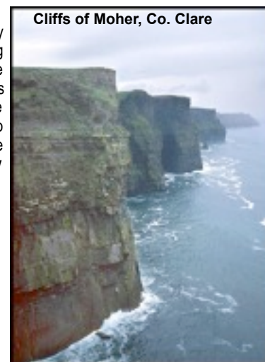
Cliffs of Moher, Co. Clare

After a hearty full Irish breakfast, embark on a beautiful journey of the West of Ireland. First depart County Galway traveling through the Burren Country , an area of silvery-gray limestone that has weathered into curious pavements and elsewhere into mountains or cliffs. Despite its windswept appearance, it is home to a number of rare Irish wild flowers. Then head west to visit the spectacular and massive Cliffs of Moher , which rise 700 feet above the Atlantic Ocean and extend five miles along the coast. Continue south along the coast and then turn to Killimer where we cross the mighty River Shannon . Arrive in County Kerry . Relax and enjoy the beautiful countryside (Rosary and meditation on-board). We arrive in lively Killarney situated with a backdrop of mountains and lakes. Holy Mass at the Franciscan Friary of Killarney . Afterwards, enjoy a group dinner at our hotel. (B, D)