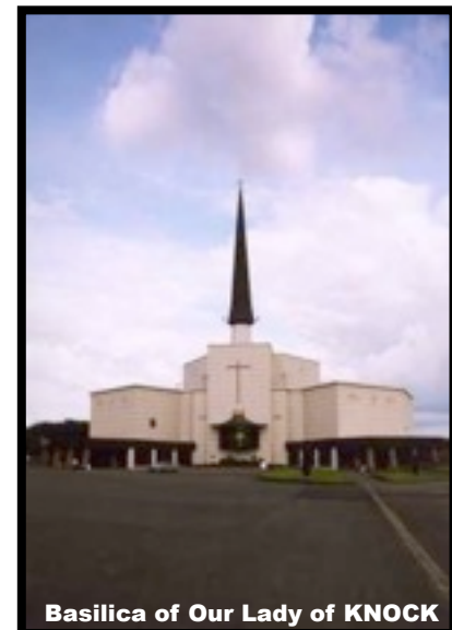
Basilica of Our Lady of KNOCK

Head south for County Sligo , an area well associated with the great poet W.B. Yeats. Sligo is also famous for the peculiar shape of its mountains, like Ben Bulbin (Mount Bulbin). Here you'll visit Tobernault , a peaceful glen where many pilgrims come to pray in remembrance of times when the Catholic faith was forbidden. Of great importance is the Mass Rock , used by Priests during Penal times in the 18 th century, when churches were closed or confiscated. Everyone who came to Mass was risking their life, especially the Priests. A prayer will be said here for all those persecuted for their faith (specially Catholic Priests). Afterwards continue to Knock , Ireland's center of Marian devotion. Knock Shrine is one of the most celebrated Marian shrines where the Virgin Mary, along with St. Joseph and St. John the Evangelist, appeared to 15 people on August 21, 1879. Holy Mass is celebrated at the site of the apparition. There will be time for Confession and Stations of the Cross. End the day here in Knock. After check-in, gather with your fellow travelers to enjoy a group dinner . (B, D)