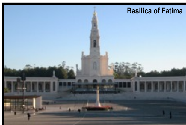
Basilica of Fatima

Day 5: Friday December 11th, 2009: Fatima: After breakfast, walk to the starting point of the famous Way of the Cross (Via Crucis). Together we will pray the Way of the Cross as we walk through the same olive tree fields the little shepherds once walked. This trail ends at the beautiful Hungarian Crucifixion Chapel, a gift from the people of Hungary. Confession available today at the shrine, followed by Eucharistic adoration. Remainder of the day is at leisure for your personal prayer and reflection, or relaxation and shopping. This evening, enjoy another fabulous dinner at our hotel. (B, D)