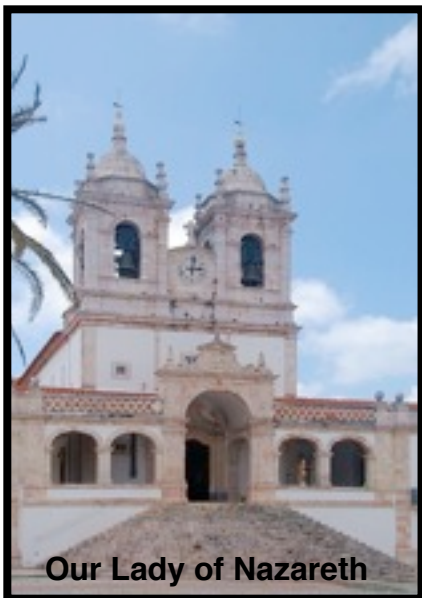
Our Lady of Nazareth

attributed the victory of this Battle of Aljubarrota to Our Lady's intercession and dedicated the gorgeous Monastery Batalha in the same site where Portugal solidified its sovereignty. Afterwards, continue East towards the Atlantic coast of Portugal to a little fishing village with a beautiful church dedicated to Our Lady of Nazareth . A local story tells us about a monk who brought a black Madonna statue from Palestine to Merida, Spain. Later in the year 711, the statue was brought to this place. To commemorate the miraculous intervention of the Black Madonna in saving the life of a Templar in 1182, the Knight built her a chapel in