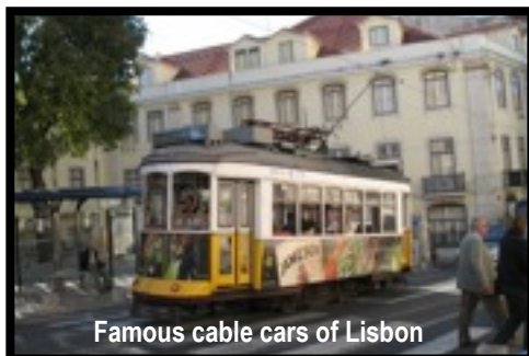
Famous cable cars of Lisbon