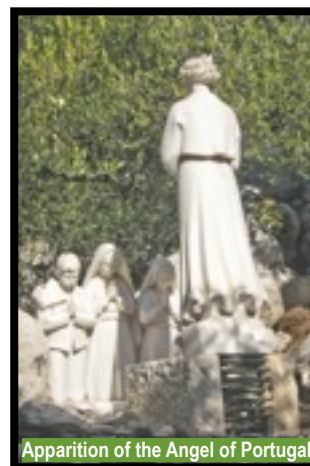
Apparition of the Angel of Portugal

Each day you may want to spend the entire day at the Fatima Shrine with opportunities for Confession, Rosary, Way of the Cross, Adoration to the Blessed Sacrament and personal prayer, or you may want to join the group for an excursion. Today's excursion visits the site of the August 19th Marian Apparition as well as the apparition site of the Angel of Portugal. Also see the homes of Blessed Francisco and Blessed Jacinta (with a possibilities of meeting relatives), as well as the home of Lucia's family in Valinhos. Tour the Parish Church where the three visionaries were baptized. Stop at a Portuguese market for lunch (cost not included) and shopping. Holy Mass at the Shrine. Dinner tonight at the hotel. For those who wish to join, the Rosary Procession follows dinner. (B, D)