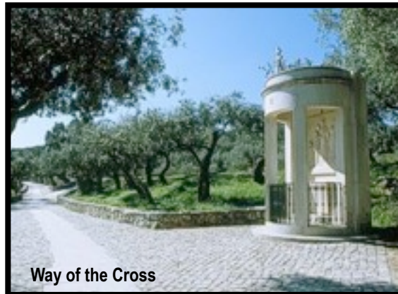
Way of the Cross