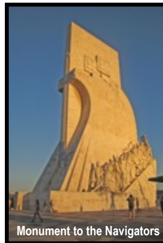
Monument to the Navigators