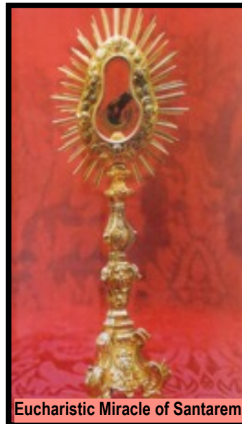
Eucharistic Miracle of Santarem

Last morning in Fatima! After breakfast, travel to a small Portuguese town to witness the 13 th century Eucharistic Miracle of Santarem . An