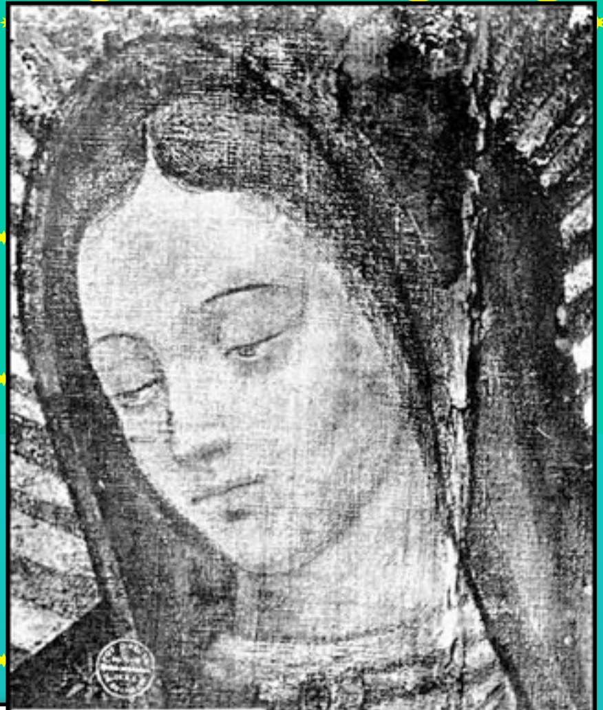
Close-up of Our Lady of Guadalupe