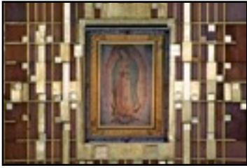
Our Lady of Guadalupe (Mexico)

An inspirational Marian Pilgrimage visiting fascinating places where we learn about the early stages of our faith in the Americas. Experience the gorgeous colonial city of Puebla. Visit the largest pyramid in the world in Cholula. See St. Michael's Miracle and Our Lady of Ocotlan. Experience all the beautiful and cultural places of the western world's largest city, Mexico City, including the home of St. Juan Diego, the remains of Blessed Miguel Pro, Ancient Teotihuacan and of course, visit the Shrine of Our Lady of Guadalupe. See the only real picture of Our Lady that is Divinely created! 2012 Departures: March 2nd/July 20th, 2012. *Departures from Minneapolis and Chicago. Other cities available for an add-on price.