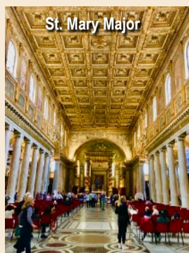
St. Mary Major