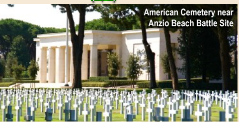
American Cemetery near Anzio Beach Battle Site

to Anzio near the site of the great World War II battle, where the breathtaking Sicily/Rome American Cemetery is located. This impacting cemetery expresses America's remembrance of those who gave the ultimate sacrifice in the Anzio and Sicily operations of WWII. Prayers will be offered for those American fallen warriors as well as those who are defending our country and our allies around the world. Then we continue on to Nettuno to stop at the Sanctuary of the Madonna delle Grazie to learn about St. Maria Goretti . Pray by her tomb, pray before relics and see the exhibit about her life. Mass* to be celebrated here. Lunch is included in the area. Tonight, enjoy a leisure evening with dinner on your own.