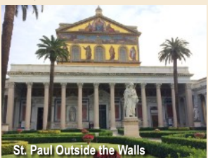
St. Paul Outside the Walls

Apia' (Apian Way) for a powerful journey experiencing how our early brothers and sisters persevered in preserving our Lord's Church. Tour through an amazing complex of underground tunnels, crypts, mausoleum tombs and chapels that fill every passageway in the Catacombs of St. Callixtus . One of the highlights of this visit will be the place where the body of St. Cecilia was found. A very realistic statue marks this place portraying the way her body laid, giving a final and resounding testimony to the Blessed Trinity at the time of her death. Next, visit the Basilica of St. Paul Outside the Walls , one of the four Patriarchal Basilicas of the Church. Although mostly rebuilt in the