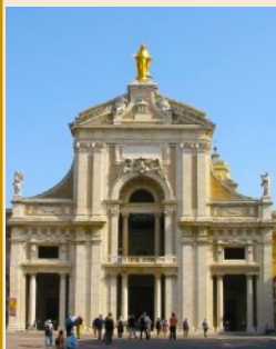
Assisi: St. Mary of the Angels

Arrive in Fiumicino Airport, collect your luggage, board your coach and enjoy a relaxing drive to the peaceful Umbria region , the land of St. Francis and St. Clare. Upon arrival in lower Assisi, pray at the 'Porziuncula' (the first Franciscan house), the Transitus Chapel (where St. Francis died), and the thorn-less rose garden , all inside the stunning St. Mary of the Angels Basilica , the head and mother church of the entire Franciscan Order. Mass* to be celebrated at Santa Maria Maggiore in Assisi where the body of Blessed Carlo Acutis is kept. After Mass, continue to upper Assisi. Enter its medieval walls to check in at our hotel for a 2-night stay. Enjoy dinner in Assisi with your fellow pilgrims. Leisure time after dinner.