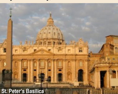
St. Peter's Basilica

Day 9 - Tuesday, October 29 th : Vatican & Scavi Tour. (B, L) Start the day with Holy Mass* at St. Peter's Basilica . After Mass, walk together toward the impressive Museo Vaticano (Vatican Museum) for a tour of its fascinating collection of historical artifacts and precious objects of art, including the magnificent Cappella Sistina (Sistine Chapel) with the famous Michelangelo frescoes featuring the Last Judgment . After the museum tour, enjoy a tour of the largest Church in the world, the Basilica di San Pietro (St. Peter's Basilica) . There will be a chance to pay respects to Saint John Paul