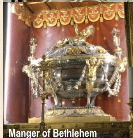
Manger of Bethlehem