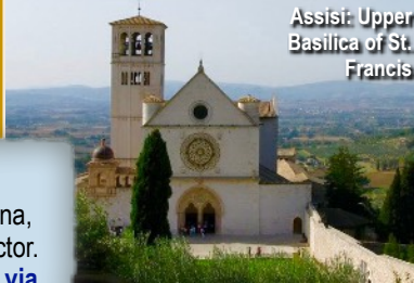
Assisi: Upper Basilica of St. Francis

Arrive in Fiumicino Airport, collect your luggage, board your coach and enjoy a relaxing drive to the peaceful Umbria region , the land of St. Francis and St. Clare. Upon arrival in lower Assisi, pray at the 'Porziuncula' (the first Franciscan house), the Transitus Chapel (where St. Francis died), and the thorn-less rose garden , all inside the stunning St. Mary of the Angels Basilica , the head and mother church of the entire Franciscan Order. Mass* to be celebrated at Santa Maria Maggiore in Assisi where the body of Blessed Carlo Acutis is kept. After Mass, continue to upper Assisi. Enter its medieval walls to check in at our hotel for a 2-night stay. Enjoy dinner in Assisi with your fellow pilgrims. Leisure time after dinner.