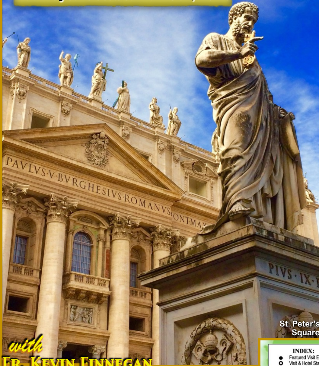
St. Peter's Square