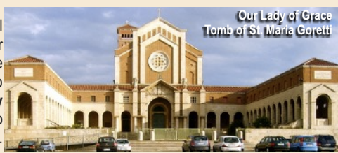
Our Lady of Grace Tomb of St. Maria Goretti

Day 9 - Tuesday, October 29 th : Vatican & Scavi Tour. (B, L) Start the day with Holy Mass* at St. Peter's Basilica . After Mass, walk together toward the impressive Museo Vaticano (Vatican Museum) for a tour of its fascinating collection of historical artifacts and precious objects of art, including the magnificent Cappella Sistina (Sistine Chapel) with the famous Michelangelo frescoes featuring the Last Judgment . After the museum tour, enjoy a tour of the largest Church in the world, the Basilica di San Pietro (St. Peter's Basilica) . There will be a chance to pay respects to Saint John Paul