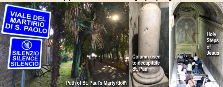
Path of St. Paul's Martyrdom

19 th century, this Basilica conserves the shape of the original St. Peter's Basilica. In addition to having portraits of every Pope, this Basilica is most famous for housing the remains of St. Paul . Afterwards, travel to the location of St. Paul's martyrdom, the Abbey of Tre Fontane (Three Fountains) . Here, tradition tells us that St. Paul was decapitated, and a fountain sprung up in each of the 3 locations where his head bounced. Afterwards, enjoy a leisure afternoon. Tonight, join your group for dinner.