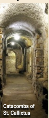
Catacombs of St. Callixtus

Day 6 - Saturday, October 26 th : Roma Cristiana 1. (B, D) Embark on an unforgettable excursion of the treasures of our faith. First, travel south down the 'Via