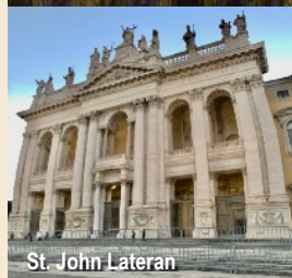
St. John Lateran

the Great at his tomb in the St. Sebastian Altar , and Pope Benedict when we visit the Crypt of St. Peter , under the main church, where the remains of many Popes can be found, including the first Pope, St. Peter . After the tours, enjoy lunch with your group at nearby restaurant. After lunch, journey below the crypt of St. Peter's Basilica into the amazing excavations known as The Scavi . Secretly excavated during World War II (to protect it from the Nazis) with the object of finding the tomb of St. Peter, the first Pope, which tradition said was below the Basilica. Walk through an incredibly preserved ancient Roman necropolis. As the past comes alive, our guides show the way through secret passageways which lead you to witness the most amazing conclusion underneath St. Peter's main Altar! "Upon this Rock I will build My Church" . This exclusive voyage below St. Peter's will forever be a strong memory and confirmation of your Catholic Faith. Walk back leisurely to the hotel (dinner on your own).