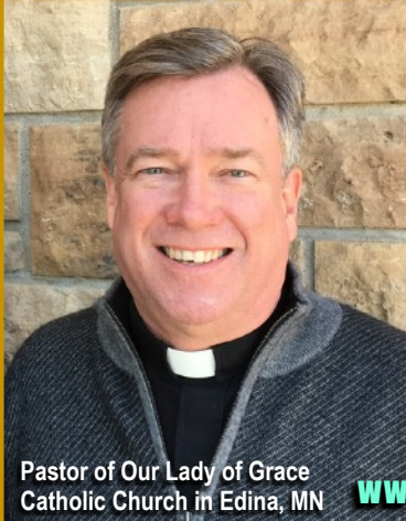
Pastor of Our Lady of Grace Catholic Church in Edina, MN